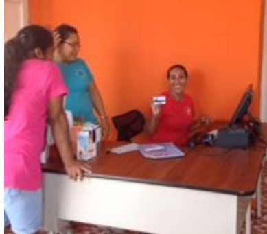
Making the 1st New Library Card