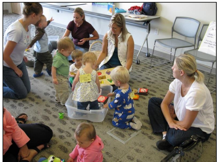
Playing with toys after Peek-a-Boo storytime at CTL.

Following a month-long hiatus in August, District-wide storytimes resumed September 2. CTL staff was excited to see our young friends again! From September through May, CTL staff presents Toddler storytimes twice on Monday mornings and twice on Tuesday mornings. We also present storytime for preschool ages twice on Monday mornings and twice on Tuesday mornings. We offer Peek-a-Boo for babies twice on Wednesday mornings, and one, all-ages Saturday storytime on Saturday mornings. During the summer, storytimes specifically for toddlers and