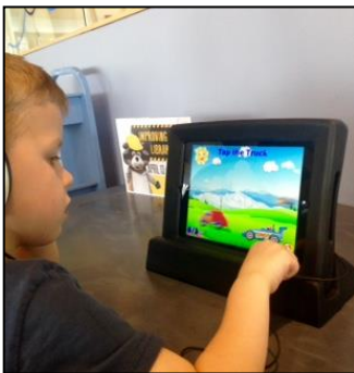
Child enjoys a new iPad May 15.