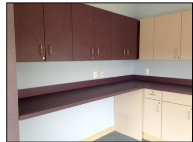
Six upper cabinets and a new countertop were installed May 12 in CTL's story time room.

May 12: Children's laminate computer countertop removed and replaced with Corian solid surface material. The new countertop has a flat edge (the old one had a wavy edge), and measures 3' x 15'. It holds two interactive iPads, one AWE games PC, and two public Internet computers.