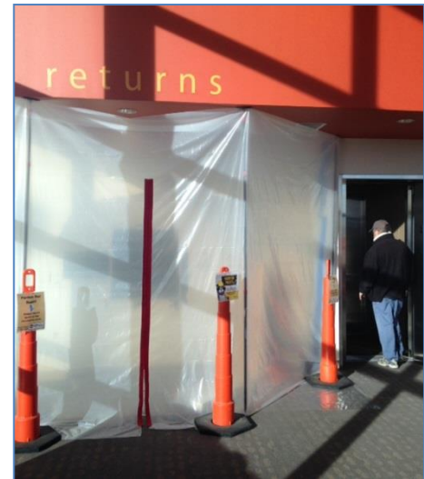
drop box during construction in preparation for