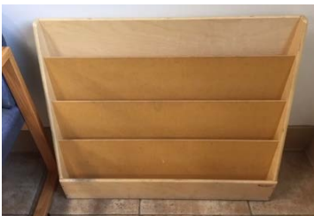
Lending library before