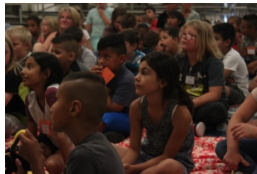
Camp Sol Bauder