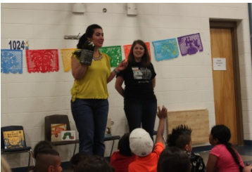
Camp Sol Harmony Village